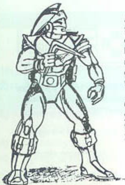
A MOST GREAT WARRIOR

A Most Great Warrior: This nameless hero has taken on the task of destroying the demon Kull and freeing the condemned souls. He is equipped with booster rockets on his back and can leap great distances. Some times he must rely on his booster rockets, sometimes he must rely on his quick reactions and jumping ability. Always he can throw his magical boomerang.