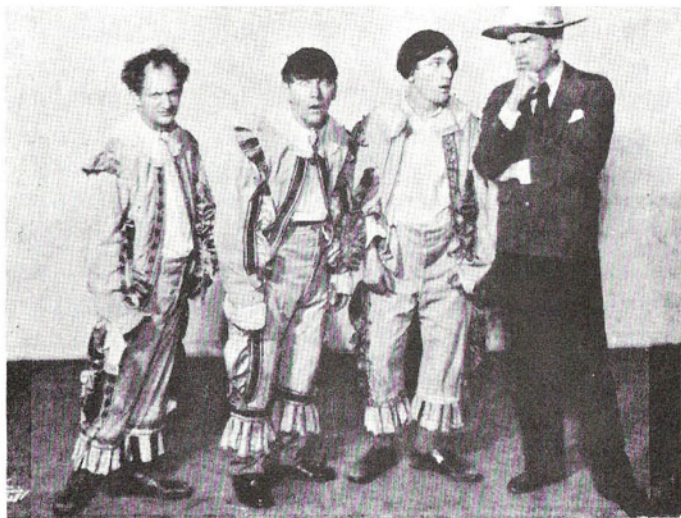
TED HEALY and his three Southern Gentlemen

The team of Ted Healy and his Stooges did well in vaudeville and appeared in several Broadway revues, such as the legendary "Earl