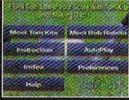
ESPN™ Golf: Lower Your Score with Tom Kite—Shot Making