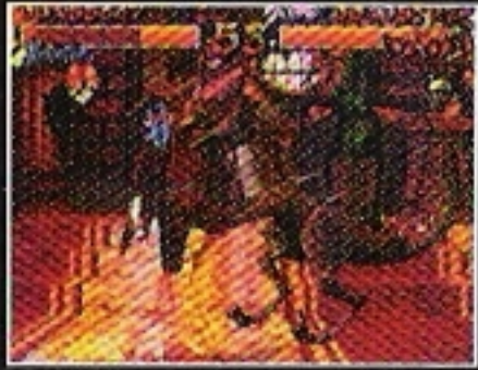
Way of the Warrior™

3DO, the 3DO logos and Interactive Multiplayer are trademarks of The 3DO Company. All other brand or product names are trademarks or registered trademarks of their respective holders. © 1994 The 3DO Company