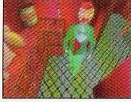
Alone in the Dark™

SPECIAL BONUS Includes 3DO Storage Manager Utility