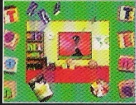
ToonTime™-in the Classroom