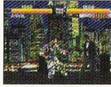
SHADOW: War of Succession™