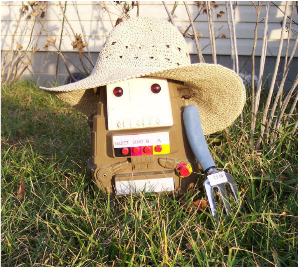
R.O.B. gardening on the Betty Ford Clinic campus.

Now, years later, R.O.B. has embraced his video gaming past. He received a 78 pin transplant, and can now use the NES lodged in his body to play games with kids. "It's a lot better than those damn Famiclones," he says. "I was part of history; I was there, and I want people to know that." He is a bit chunkier these days, and he still cannot move his arms, but he remains optimistic. "I would like to be in the home of kids who will appreciate me for what I am," he says. "Plus, I could use the money."